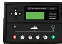
DSE-7320 Remote Control Panel