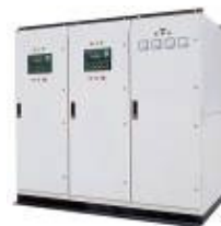
DSE-550 Parallel Control Panel system